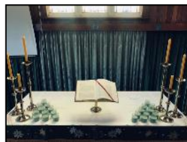
The Altar in Ngatea Parish Church

The Interchurch Council is made up of representatives of each of the Thames Churches, it was formed in response to the difficulties the Thames Church leaders were having. On Thursday 20th Feb, we formally gave all its responsibilities back to the Ministers' Association, believing they are now in a better relational position to work together. I have chaired this group since 2018 and have been very proud of the work they have done.